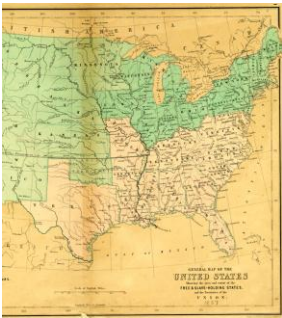
General Map of the United States by Henry D. Rogers (1857)