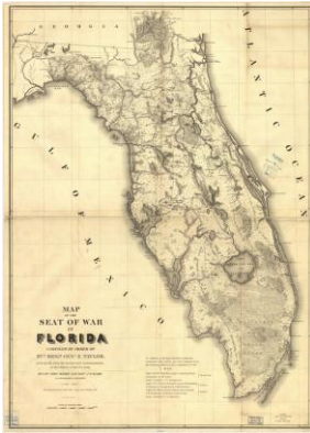
Map of the Seat of War in Florida, created by order of General Zachary Taylor (1839)