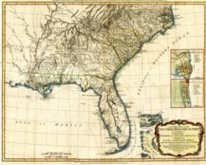
Romans' General Map of the Southern British Colonies (ca. 1776)