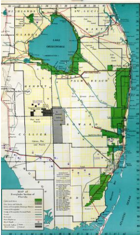
Works Progress Administration Map of Seminole Camps (ca. 1940)